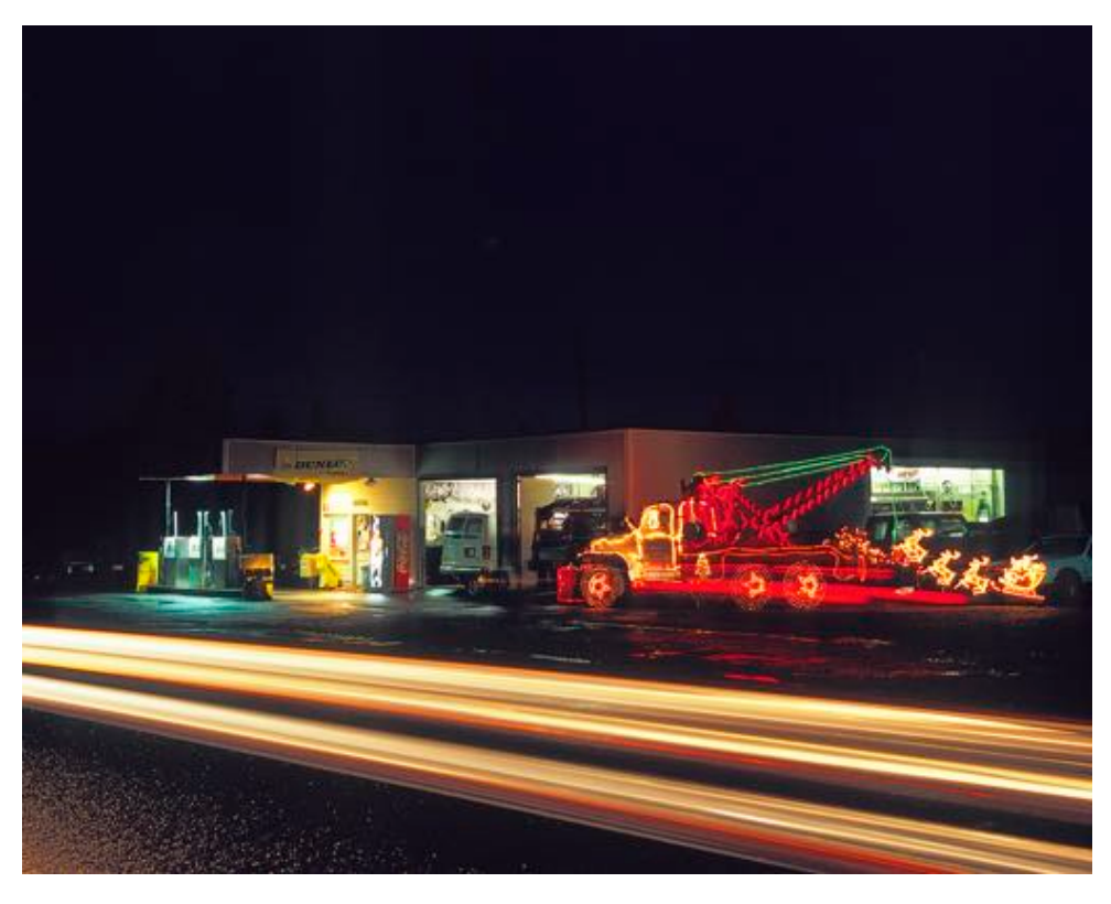
Engles Tow Truck, Terry Donnelly