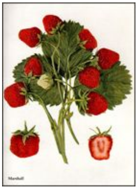
The Marshall Strawberry

fruit with a longer shelf life, the Marshall strawberry dropped out of use in favor of more robust but less flavorful strawberries.