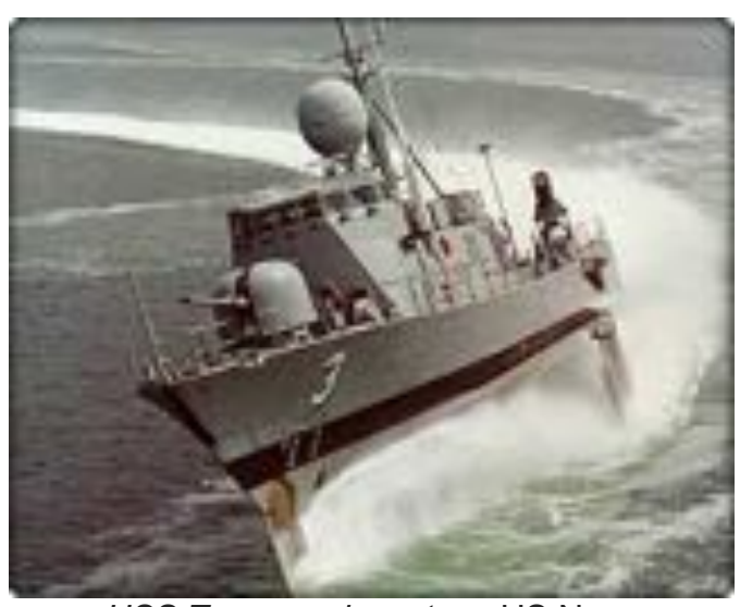
USS Tucumcari

Boeing then built six 131-foot Patrol Hydrofoil Missileships for NATO in 1974. That same year, Boeing built its first passenger hydrofoil, the Jetfoil, which could carry up to 400 passengers. Boeing built 23 of these Boeing 939 boats for passenger service in Hong Kong, the English Channel, the Canary Islands, Saudi Arabia, and Indonesia. Washington State Ferries considered using them for passenger-only service, but decided they were too expensive to purchase and operate. These boats were often seen around Vashon as they performed sea trials and refueled at the old Standard Oil Dock located at the current Tramp Harbor fishing pier.