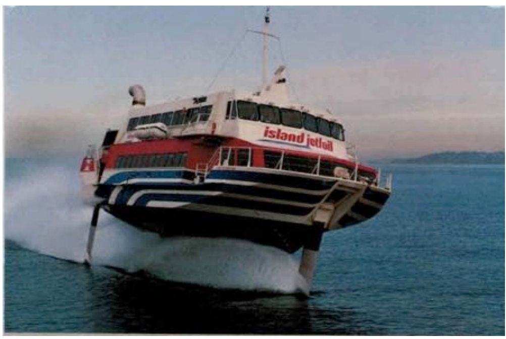
Boeing 939 Jetfoil

Boeing then built six 131-foot Patrol Hydrofoil Missileships for NATO in 1974. That same year, Boeing built its first passenger hydrofoil, the Jetfoil, which could carry up to 400 passengers. Boeing built 23 of these Boeing 939 boats for passenger service in Hong Kong, the English Channel, the Canary Islands, Saudi Arabia, and Indonesia. Washington State Ferries considered using them for passenger-only service, but decided they were too expensive to purchase and operate. These boats were often seen around Vashon as they performed sea trials and refueled at the old Standard Oil Dock located at the current Tramp Harbor fishing pier.